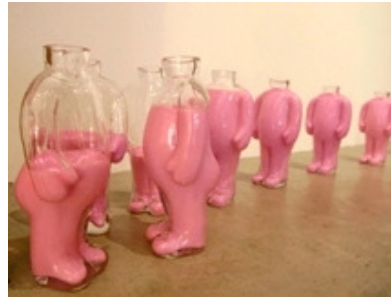
Color Based (detail) installation

In January, Los Angeles-based artist YaYa Chou will create an installation at CSP thanks to the Visiting Artist Program. Chou creates work in various media including animation, painting and drawing, installation and sculpture.