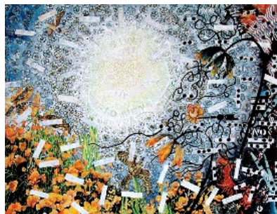
Detail from Yes No, Nova Totem Series , watercolor 22" x 30"

He watched the landscape change as a result of mining and timber interests. The majority of his paintings from the Nova Totem Landscape Series express